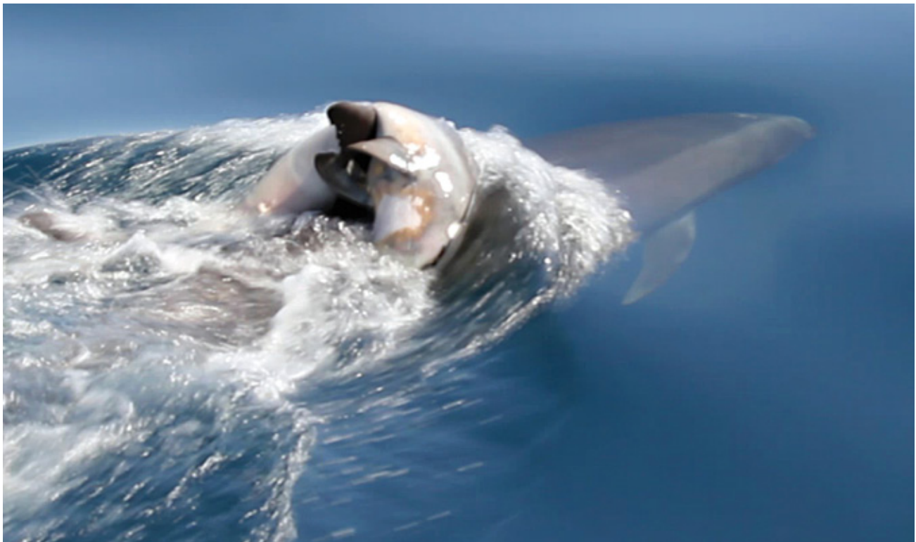
DOLPHIN MOTHER carries the body of her dead calf on her dorsal fin in the waters off Dana Point, Calif.

collapsed, a matriarch named Grace from another elephant family immediately came to her aid, using her tusks to support Eleanor back onto her feet. When Eleanor fell again, Grace stayed with her, pushing on her body, for at least an hour, even though her own family moved on. Then Eleanor died. During the course of the week that followed, females from five elephant families, including Eleanor's own, showed keen interest in the body. Some individuals appeared upset, pulling at and nudging the body with trunk and feet or rocking back and forth while standing over it. Based on the females' reactions (at no point during this period did a bull elephant visit the carcass), Douglas-Hamilton concluded that elephants show a so-called generalized response to dying and death—grieving not only for the loss of close kin but for individuals in other families.