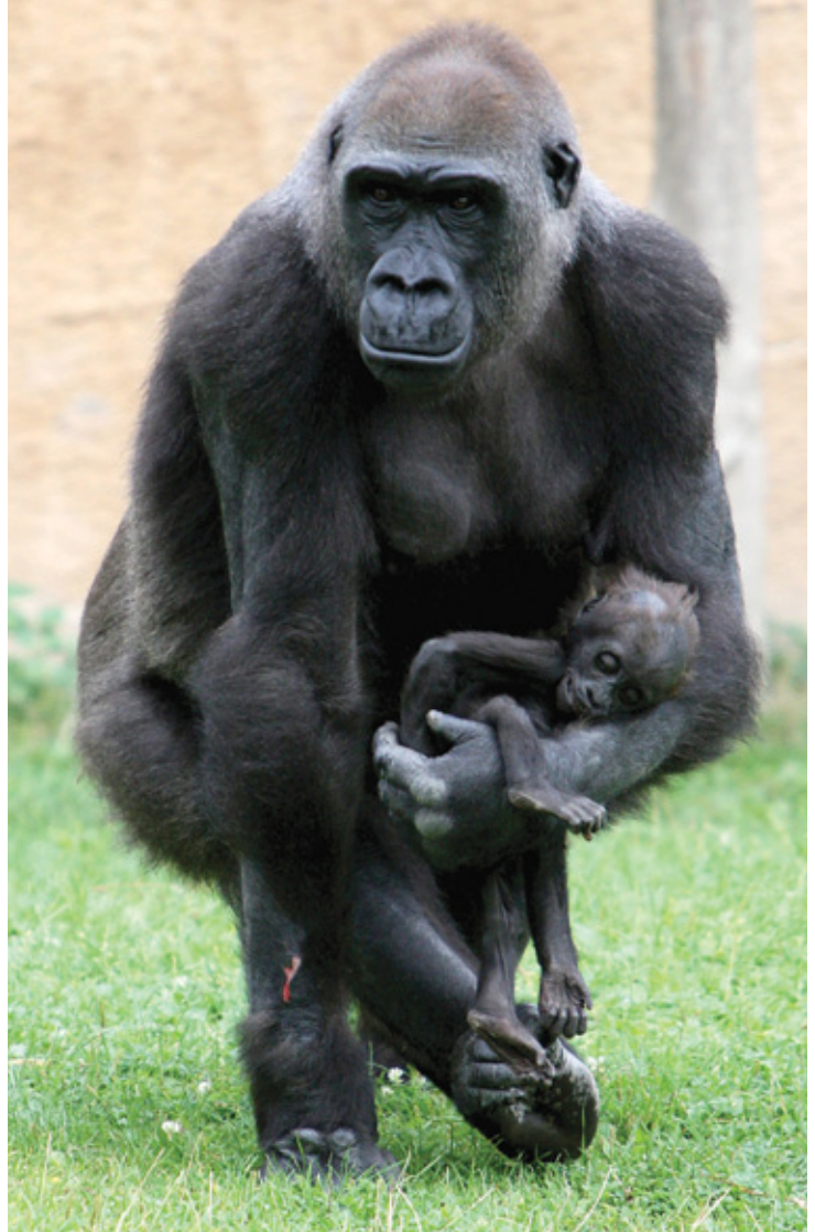
FEMALE GORILLA clutches her dead baby in a zoo in Münster, Germany. Although such behavior is not sufficient to demonstrate mourning, mothers who lose infants are among the strongest candidates for experiencing survivor’s grief.

IT IS LOGICAL to think that long-lived species whose members partner most closely with others in tight-knit pairs, family groups or